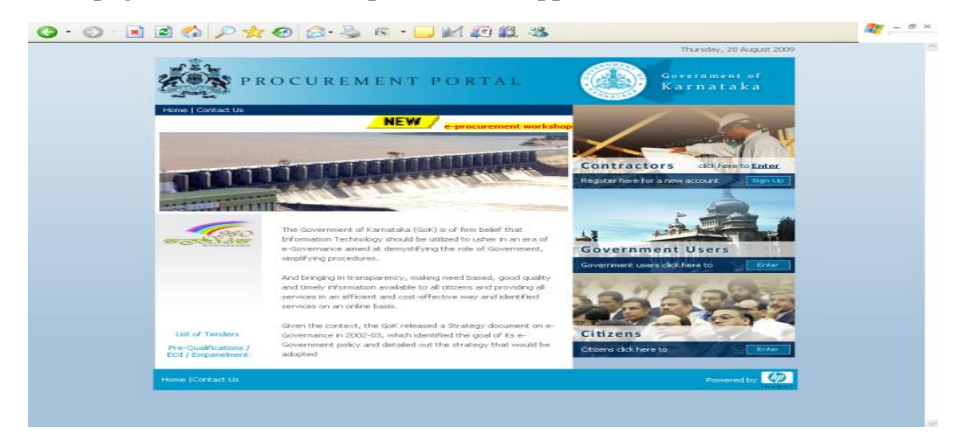
Fig 1. Home page of e-Procurement portal

The bidder can pay the EMD and tender transaction using any of the following payment modes in the e-Procurement portal: